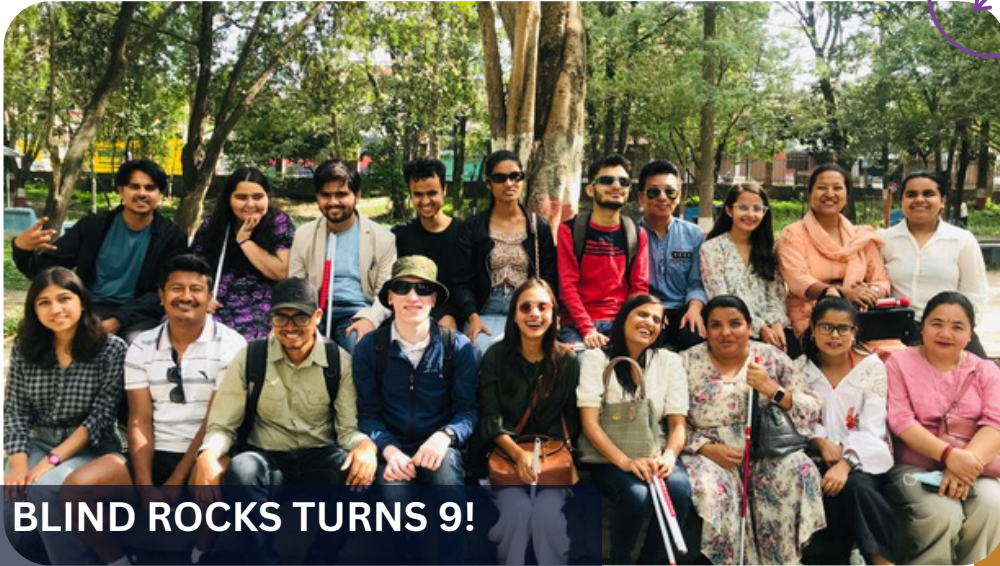
BLIND ROCKS TURNS 9!