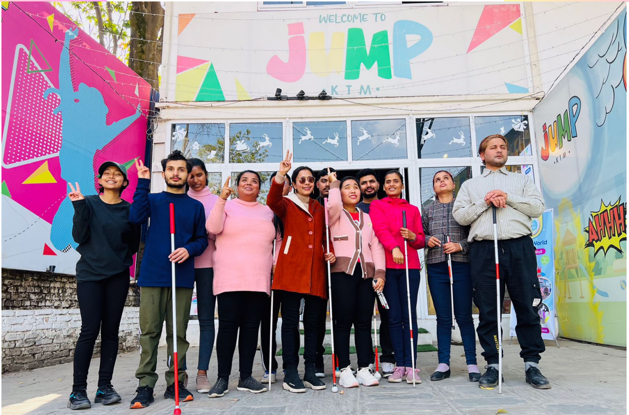
BLIND ROCKERS ARE POSING FOR THE CAMERA RIGHT INFRONT OF JUMPKTM ENTRANCE

Entertainment is one of the key elements in restoring quality of life, with this thought in mind we blind rockers went to JumpKTM on Feb 20, 2024. BlindRocks in collaboration with Jump KTM organized an inclusive initiation “Jump to Bounce Back” at Jump KTM. The event was held at Dhumbarahi JumpKTM, Trampoline and Amusement Park, to provide a fun and accessible experience for 11 blind and visually impaired people.