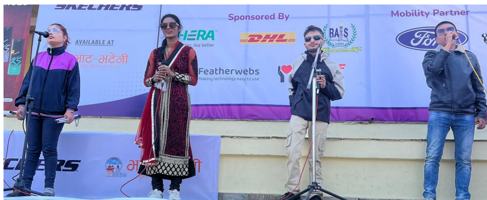
BLIND ROCKS BAND WITH MICROPHONE READY TO ROCK THE STAGE

The event was executed with a clear purpose, with all proceeds dedicated to promoting women’s empowerment and combating gender-based violence. Blind Rocks! was grateful and honored to be a part of this inclusive and inspiring event, was glad to support in any way possible.